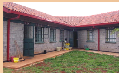
The Half-Way House, Nairobi