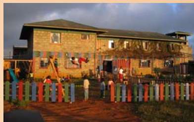
The Children's Home, Limuru

To date, we care for 70 children - ranging from newborn to 17-yr-olds. In order to maintain the bond between the children and their imprisoned mothers, The Nest ensures the children regularly visit their mothers in prison. We also care for a number of abandoned babies for whom we try to find loving families.